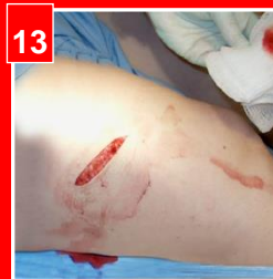
13 Clean wound using NTT