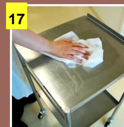
17 Clean trolley according to local policy