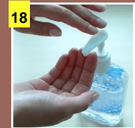
18 Clean hands with alcohol hand rub or soap & water