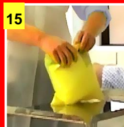
15 Dispose of equipment, waste, gloves then apron & immediately...