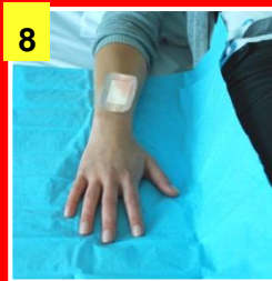
8 Place a sterilized drape (Critical Aseptic Field) under the wound