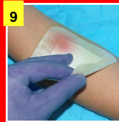
9 Remove dressing, using NTT & dispose of dressing in waste bag