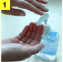
1 Clean hands with alcohol hand rub or soap & water