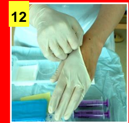
12 Apply sterilized gloves & assemble equipment using NTT