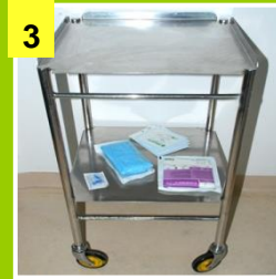
3 Gather dressing pack & equipment & place on bottom shelf