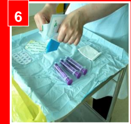
6 Open equipment onto a Critical Aseptic Field using non-touch technique (NTT)