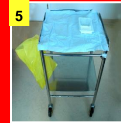
5 Open dressing pack & position waste bag