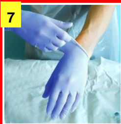
7 Apply non-sterilized gloves