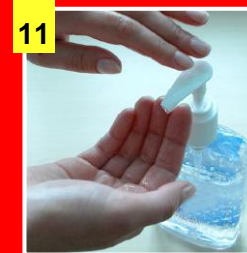
11 Clean hands with alcohol hand rub or soap & water