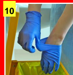
10 Dispose of gloves