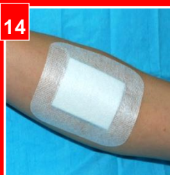
14 Dress wound using NTT