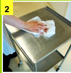
2 Clean trolley according to local policy creating a General aseptic field