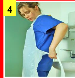
4 Apply apron (Re-clean hands if required)